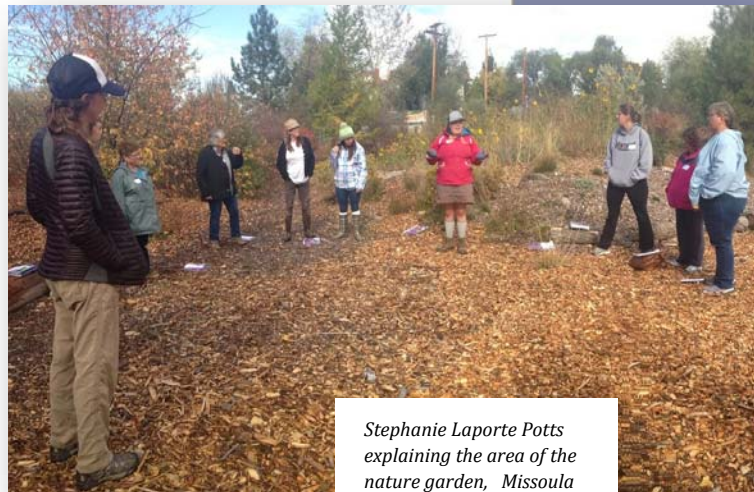
Stephanie Laporte Potts explaining the area of the nature garden, Missoula Workshop on October 1, 2016