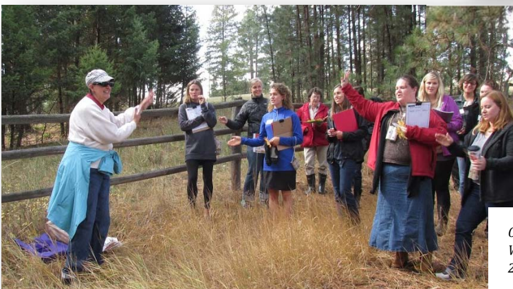
Outdoor Activity, Kalispell Workshop on October 1, 2016