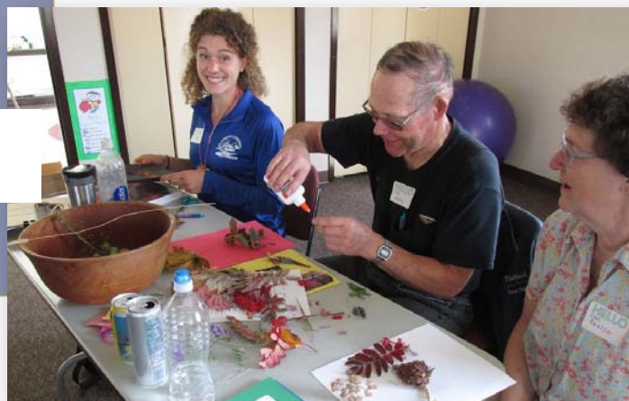
Table Activity, Kalispell Workshop on October 1, 2016