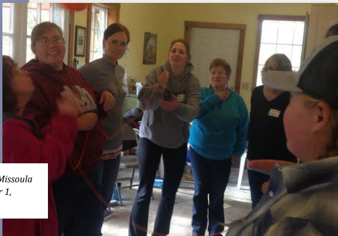
Web of Life Activity, Missoula Workshop on October 1, 2016

For the full story; https://www.plt.org/news/project-learning-tree-turns-40/